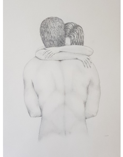
Sandra Barlow I Want Your Love II Graphite 420x300mm Price: $275