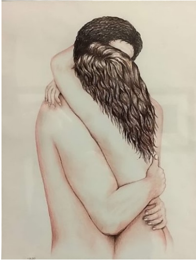
Sandra Barlow I Want Your Love V Graphite 420x300mm Price: $275