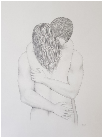
Sandra Barlow I Want Your Love III Graphite 420x300mm Price: $275