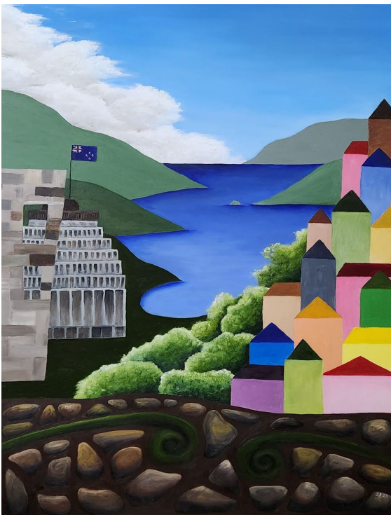
Te Whanganui-a Tara - Wellington Oil on Board 900x600mm