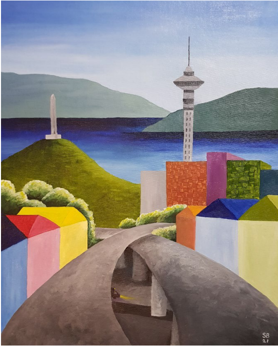
Tāmaki Makaurau - Auckland Oil on Board 760x500mm

All four paintings are on loan from private collections