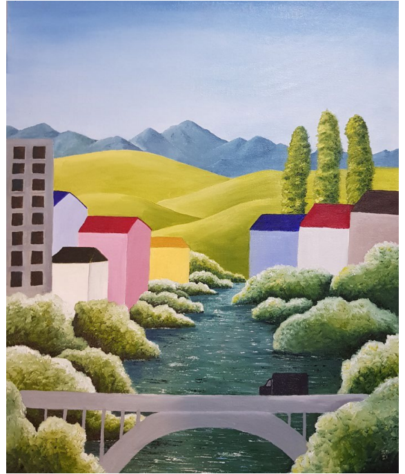
Kirikiriroa - Hamilton Oil on Board 600x500mm