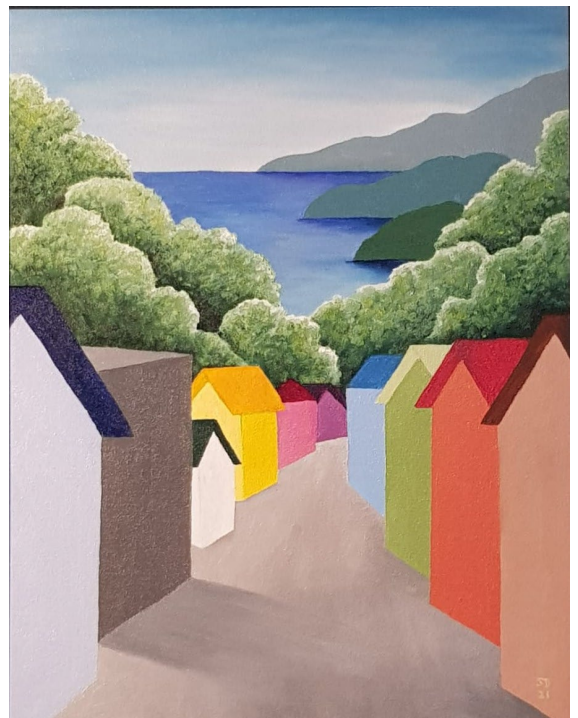
Ōtepoti - Dunedin Oil on Board 340x260mm