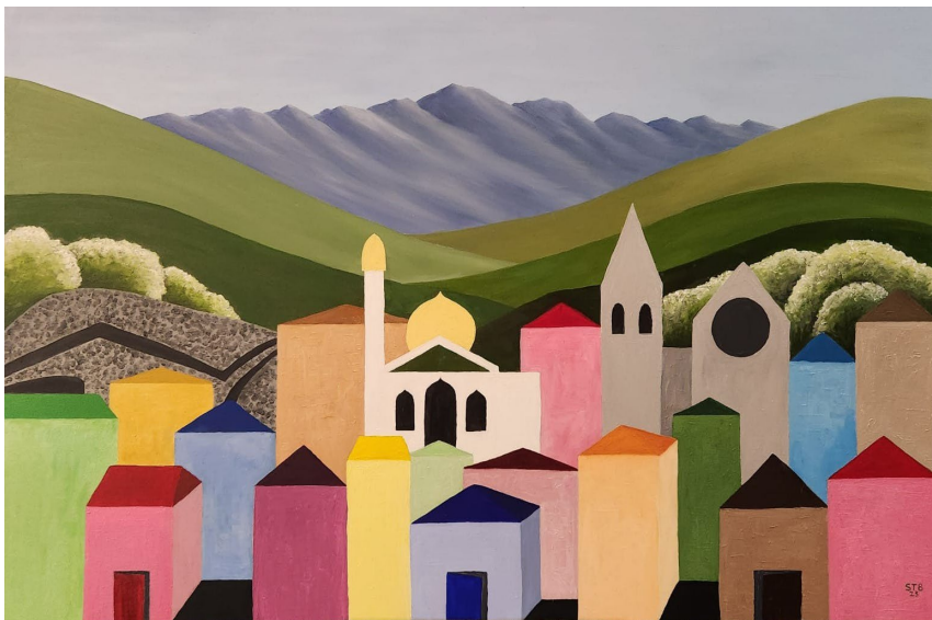
Sandra Turner-Barlow, Ōtautahi - Christchurch , Oil on Board 600x900mm Price on request

Artistically, Turner-Barlow's style echoes the feel of Don Binney, landscape designs from Michael Illingworth together with the moderne senses of Rita Angus. As seen in Robin White's 2023 exhibition in the Auckland Gallery, she likewise employs a flattened perspective of some key structures thus bringing them into immediate sharp focus. A bright vibrant signature colour palette makes these compositions easily accessible to the eye. The Welcome Swallow Gallery celebrates this remarkable, original series of paintings by gallery artist, Sandra Turner-Barlow.