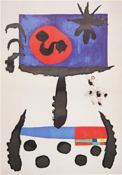
36. Joan Miro Spanish 1893 - 1983 Maison de la Culture de Bourges Exhibition, 1975 42 x 31cm