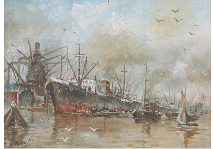
19. J. du Blauw Dutch 20 th century Rotterdam Harbour Oil on board 15 x 21cm