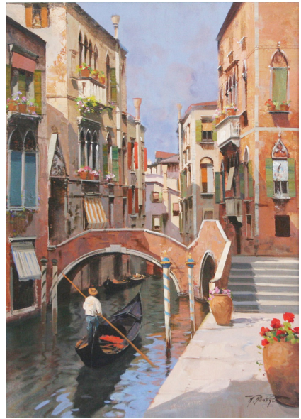
2. Raimondo Roberti Italian born 1947 Venetian Canal with Gondola Oil on canvas 70 x 50cm