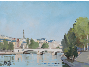
18. Brutta Matta French born 1946 Pont du Carrousel, Paris Oil on board 21 x 26cm