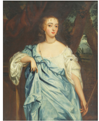
27. Unknown artist British 19 th C Lady in Blue (style of Gainsborough) Oil on canvas 38 x 28cm