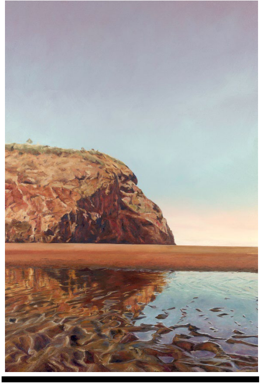
Renata Nemeth The Shore of Silence Oil 900x600mm Price: $4200