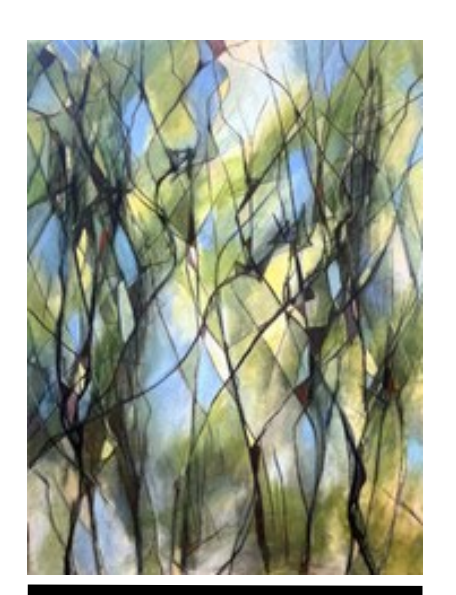
Juliet Roper Bird Song Acrylic on Framed Canvas 1022x915mm Price: $1800