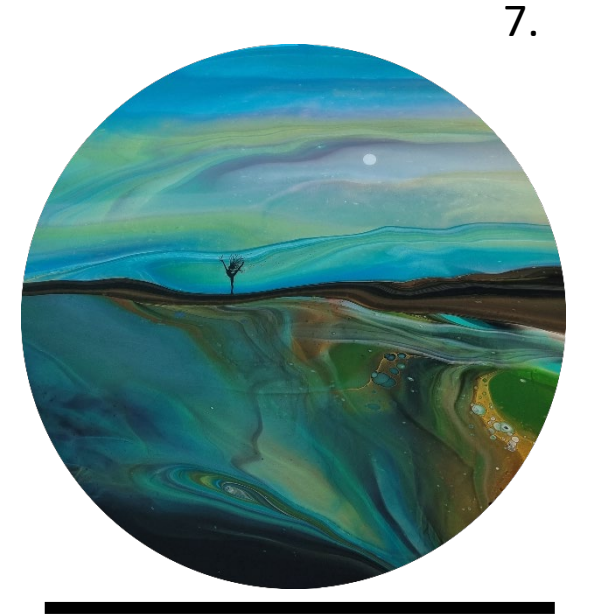
Toni Kingstone Autumn Dance Acrylic and Resin 800mm d. Price: $1550