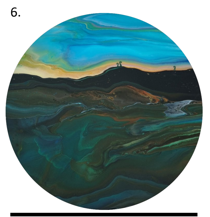
Toni Kingstone Te Wai Pounamu Acrylic and Resin 1200mm d. Price: $4250