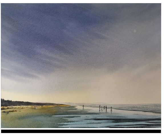
Chris Greenslade December Evening at Waitarere Beach* Watercolour 270x350mm Private Collection