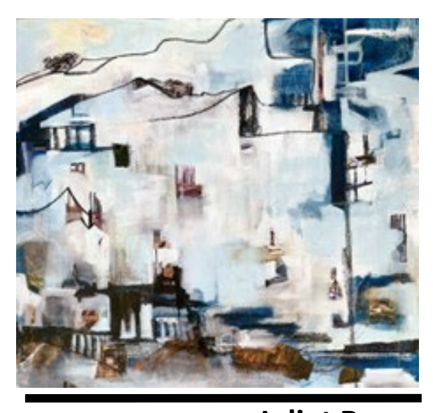
Juliet Roper The Traveller's Tale Mixed Media on Paper Mounted on Cradled Board