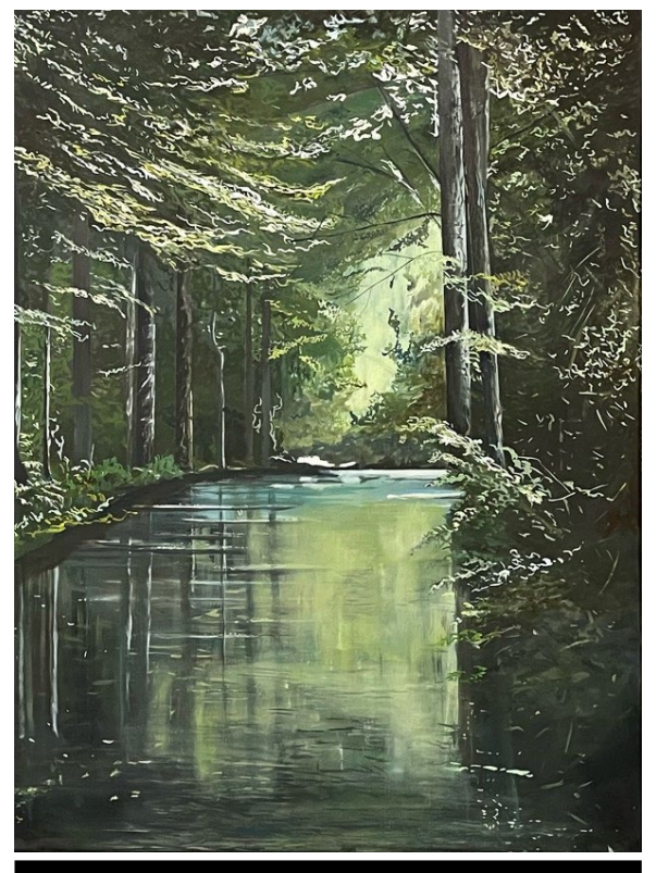
Kirsten McIntosh Symphony of Light Oil 1016x762mm