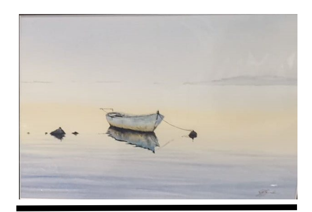
Chris Greenslade End of a Good Day Watercolour, 510x650mm Price: $1000