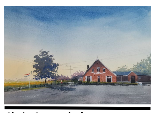
Chris Greenslade Zenders Cafe Watercolour, 390x420mm