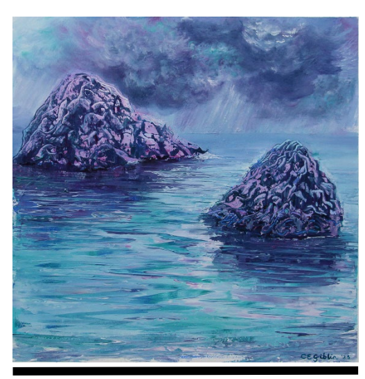
Charlotte Giblin Still Waters Acrylic 510x510mm Price: $840