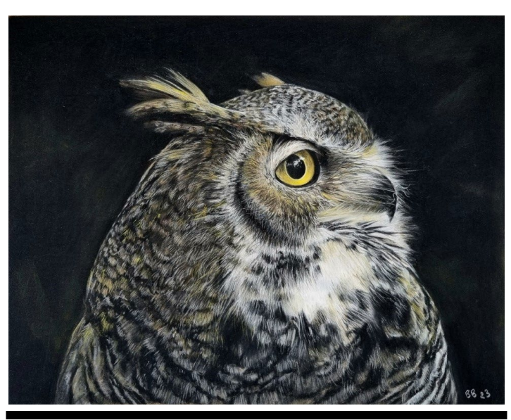
Bernadette Ballantyne Whakaaro Nui Owl Soft Pastel 280x355mm Price: $1980