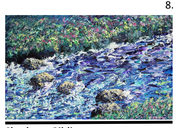
Charlotte Giblin The Crossing Acrylic with Gloss Varnish 405x605mm Price: $840